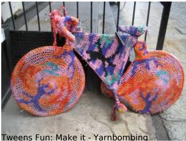
Tweens Fun: Make it - Yarnbombing

What is yarnbombing? Learn about this fun form of art and make a yarn project to take home. Don't forget to bring a friend.